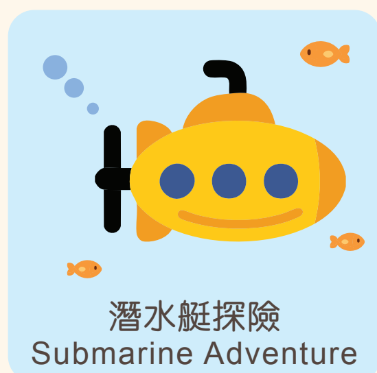
潛水艇探險 Submarine Adventure

From July onward, the Toy Library will transform into an ocean deep to explore some play ideas from the picture books. Children can pretend to be little divers to explore the ocean deep and find out different marine species here!