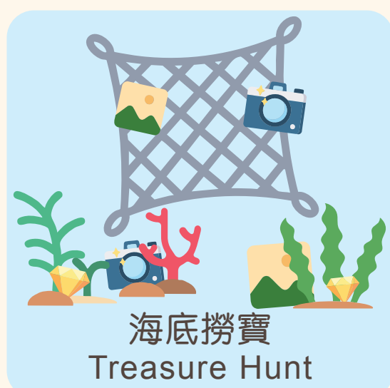
海底撈寶 Treasure Hunt