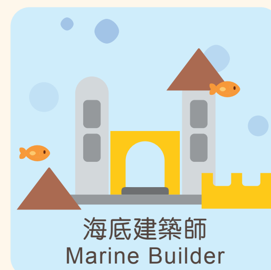
海底建築師 Marine Builder