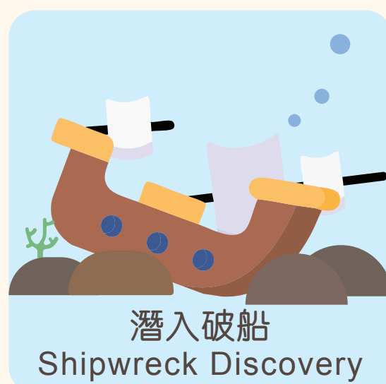
潛入破船 Shipwreck Discovery