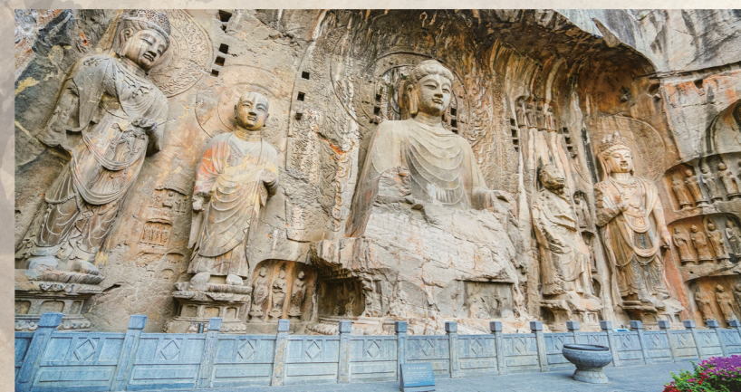
位於洛陽的龍門石窟是「中國四大石窟」之一，窟龕逾 2 300 個，建於唐代的約佔三分之二。