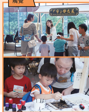
參加「『字』學之道」工作坊的讀者認識活字印刷歷史並體驗印刷小遊戲。