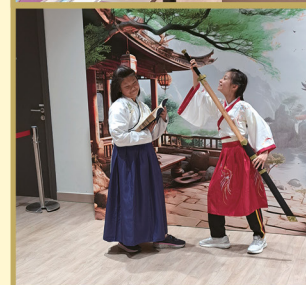
華服體驗區 @ 深水埗公共圖書館