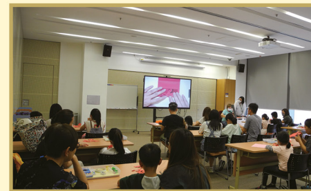
剪紙工作坊 @ 屏山天水圍公共圖書館

各區指定圖書館於四月二十七日和二十八日舉辦以中華文化為主題的活動，包括專題書籍展覽、攤位遊戲和中華文化工作坊。