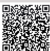
《食物無罪》 圖書館藏