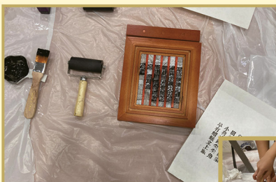
活字印刷中華文化攤位 @ 元朗公共圖書館