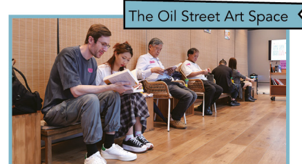
A variety of books were available in the reading locations, allowing people in different areas to take part in the activity.