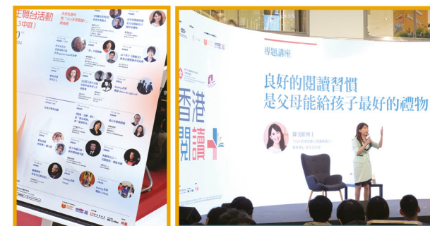
Around 20 talks by renowned writers were held in the carnival.

The HKPL joined the "2024 Hong Kong Reading +" carnival, from 20 to 23 April at New Town Plaza in Sha Tin. The carnival, organised by the Hong Kong Publishing Federation with the theme "n reasons for reading", consisted of large-scale exhibition, talks by renowned writers and various cultural activities. A designated area was also set up for displaying selected publications and cultural and creative products from Shenzhen.